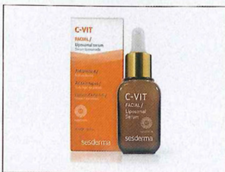
C-VIT FACIAL / Liposomal Serum

"One nanometer equals 1 billionth of a meter," Dr. Serrano continued. "Large molecules do not penetrate the skin; therefore, many skincare products remain in the upper layers of the epidermis and never reach the intended target due to the skin's barrier function. With nanotechnology, active ingredients are encapsulated in small liposomes, which improves the stability of chemically unstable ingredients (such as vitamin C), protects the active molecule and increases penetration through the skin to the targeted area."