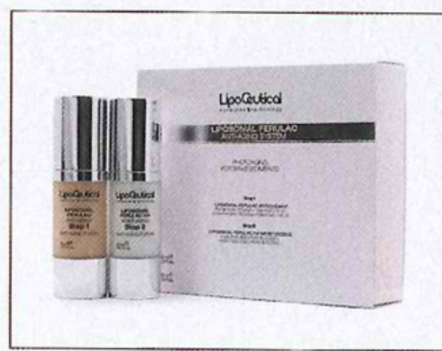
LIPOSOMAL FERULAC Anti-Aging System

Within the range of nanosome products for professional use, the company also offers the LIPOSOMAL FERULAC Anti-Aging System, an antioxidant peel system to treat and prevent the symptoms of photo-aging (wrinkles, flaccidity, uneven skin tone, sun/age spots) and dry and rough skin.